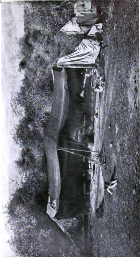
THE HOME OF THE BEDAWIN